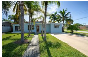
1124 N 13th Ter

MLS#: F10090118 Status: A Price: $420,000 SqFt: Beds: 3 Bath: 2 (2 0)