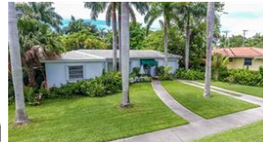
1244 Polk St

MLS#: A10304177 Status: A Price: $435,000 SqFt: 1,626 Beds: 3 Bath: 2 (2 0)